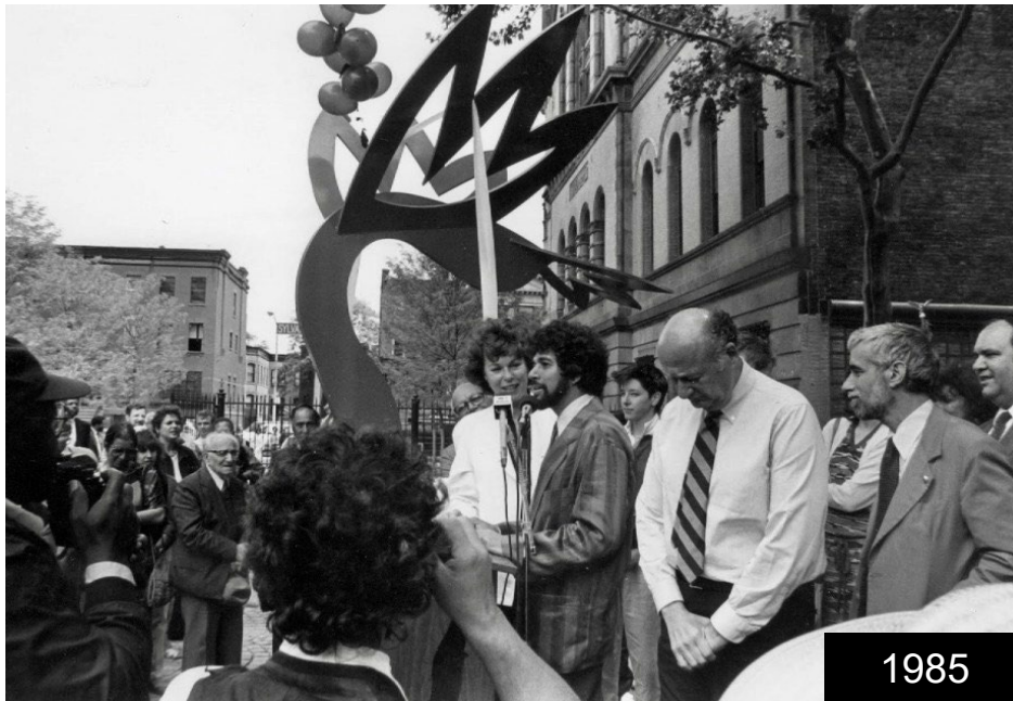
Dedication of Growth , the first Percent for Art commission, 1985

In 1982, Local Law 65, the Percent for Art Law was passed, which states that 1% of the capital funds appropriated for newly constructed or reconstructed City-owned buildings or sites must be allocated for works of art.