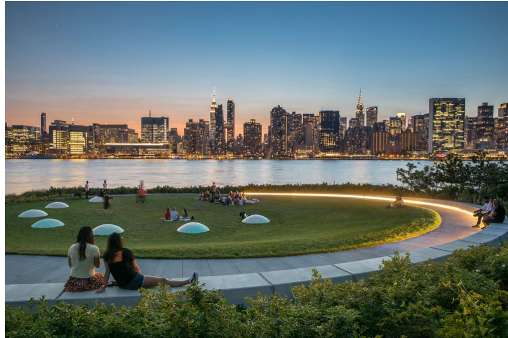
Nobuho Nagasawa Luminescence , 2018 Hunter's Point South Park, Long Island City 11101