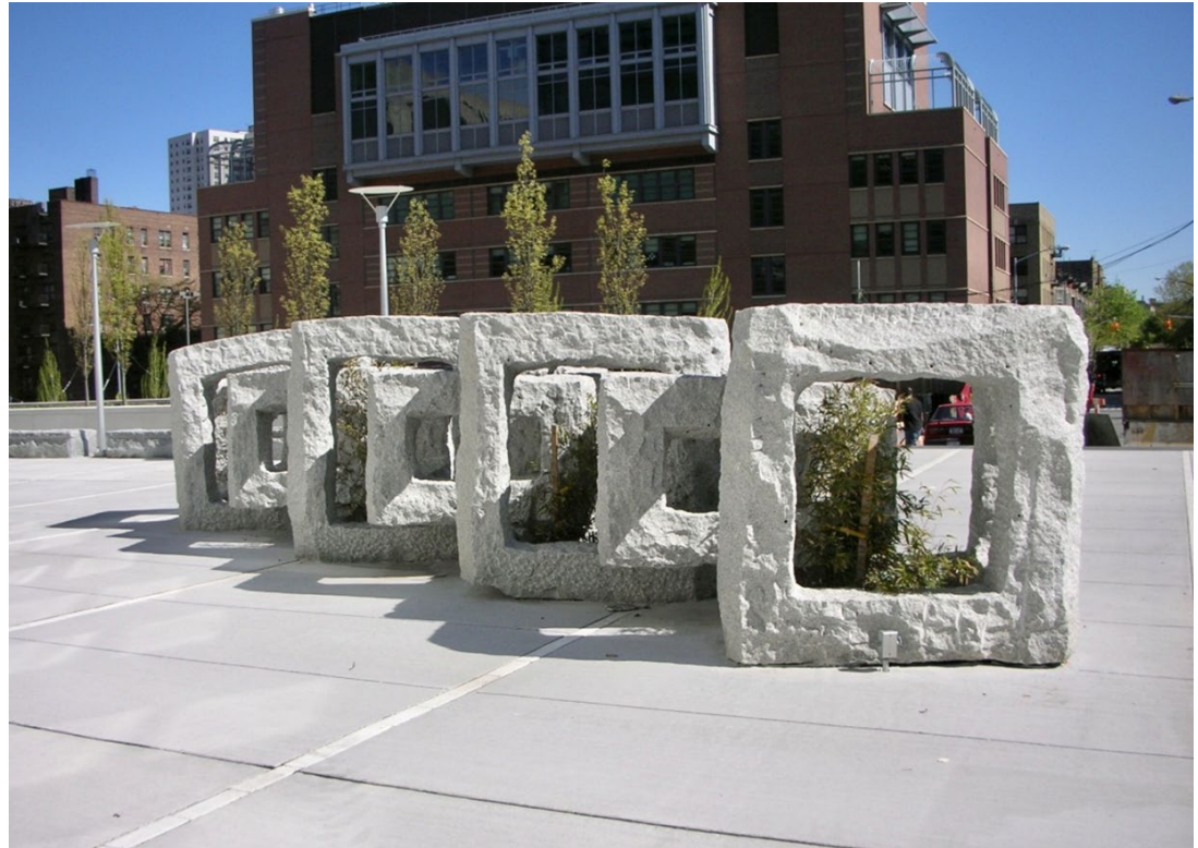
Cai Guo-Qiang One Stone , 2007 Bronx County Hall of Justice 265 E 161 st St, The Bronx

with Chinatown Connections in the subject line