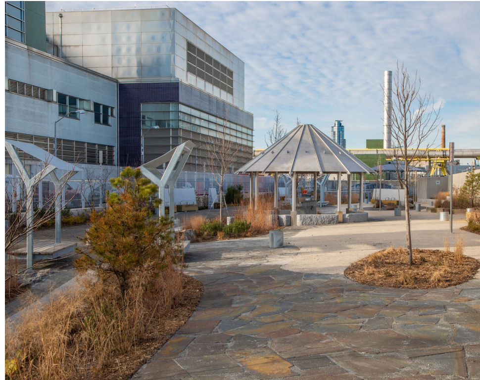
George Trakas Waterfront Nature Walk , 2007, 2021 Newton Creek Wastewater Treatment Plant, 329 Greenpoint Ave, Brooklyn, NY 11222